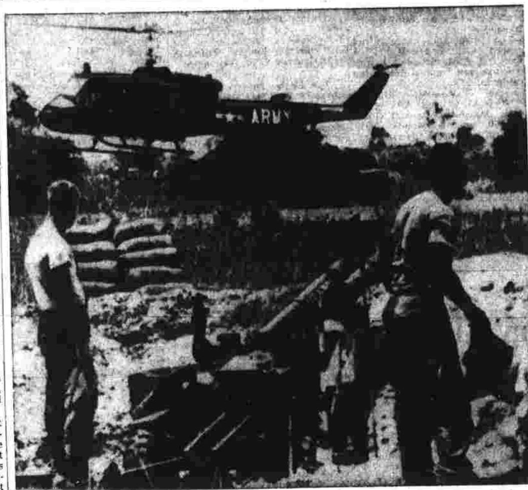
Crew members stand by dug-in artillery piece on the defense perimeter of Bien Hoa air base as officers in a helicopter make an inspection tour. Both American and Vietnamese officers were on the tour.

HARTFORD (AP)—Republican leaders urged the legislature today to go on record as supporting the actions of President Johnson "in defending the cause of freedom in South Viet Nam and the Dominican Republic." A resolution expressing support for the President was read and passed at a closed GOP caucus and received "enthusiastic support," they said. It will probably be acted on formally in the House tomorrow, they said, and then forwarded to the Senate. The resolution states that criticism of the President's actions "may tend to create abroad a false impression that the people of the United States do not support their chief executive in his attempt to assist the people of South Viet Nam and the Dominican Republic against subversion and aggression."